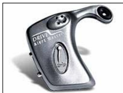
Wake up! The Drive Alert Master emits a loud beep when a driver's head slumps below a predetermined angle.

The TheraSpa seat topper features 10 motors that deliver relaxing pulses across five body zones.